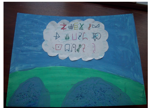
A sample of the students' artwork depicting following Christ, not just believing in Jesus.